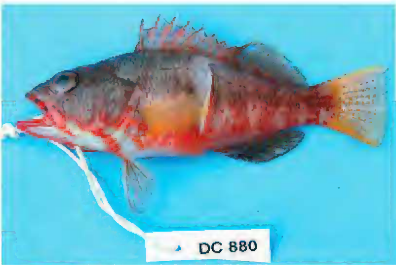
FIGURE 2. Serranus pulcher specimen from Príncipe Island, directly after capture.

Color in vivo : Color extremely variable (Figs. 2–9). The following patterns appear to be most